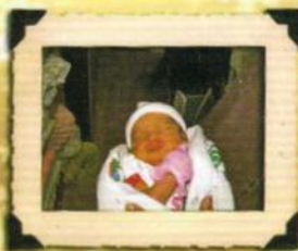
All bundled up!