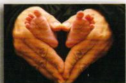
The second picture is only 7 months later.

The first photo is the perfectly formed feet of a 10-week unborn child. If the mother had the chance to see her baby's tiny feet and beating heart on an ultrasound screen, there's a 90% chance she would have chosen to keep her baby.