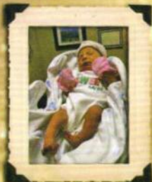
Look at those tiny feet